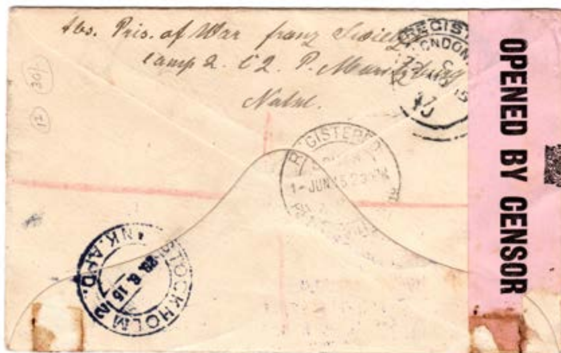
Figure 1b Reverse of June 1915 cover