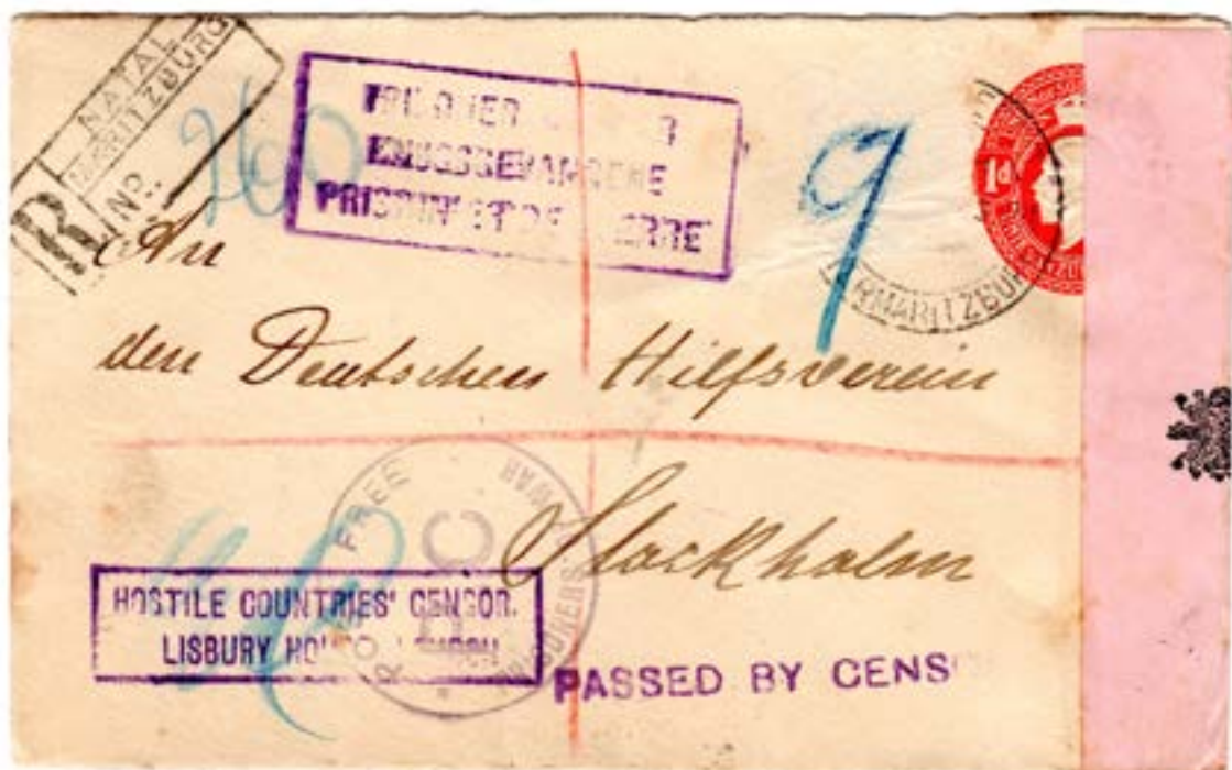
Figure 1a June 1915 cover front

A number of Germans and Austrians from South Africa and a few from Rhodesia and other British areas in southern Africa were interned during the first world war. The larger camp was Fort Napier in Pietermaritzburg. For many years I had what looked like a reused registered envelope (fig 1) from the camp to the Deutsches Hilfsverein (German aid association) in Stockholm, sent 1 June 1915. It had a trilingual PRISONER OF WAR handstamp on the front. It transited London on 22 June and arrived in Stockholm on 28th. A stamp had been removed and the envelope was censored by the "HOSTILE COUNTRIES' CENSOR, / SALISBURY HOUSE, LONDON". FJ Carter 1 records that the rare Salisbury House mark usually occurs on registered letters from the Colonies.