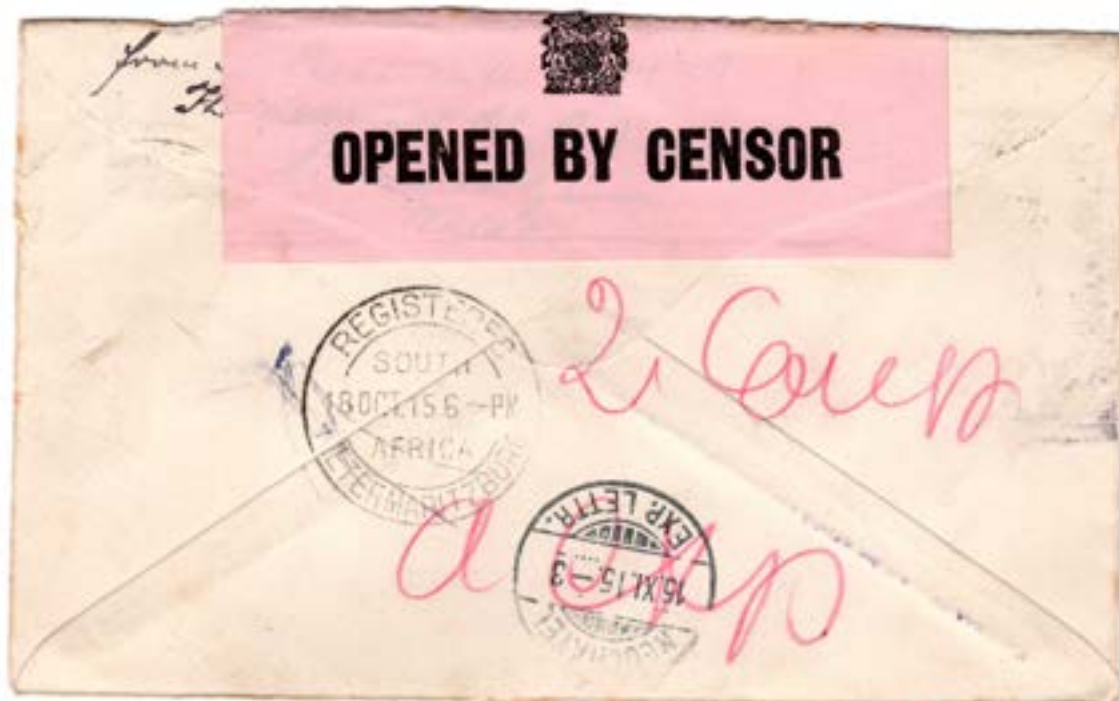
Figure 2b reverse of Oct 1915 cover

I conclude that the stamps were removed by the censors, but I have seen very few WWI registered POW items to know if this was usual. Both were addressed to neutral countries but obviously destined for forwarding to “the other side”! Can anyone show others?